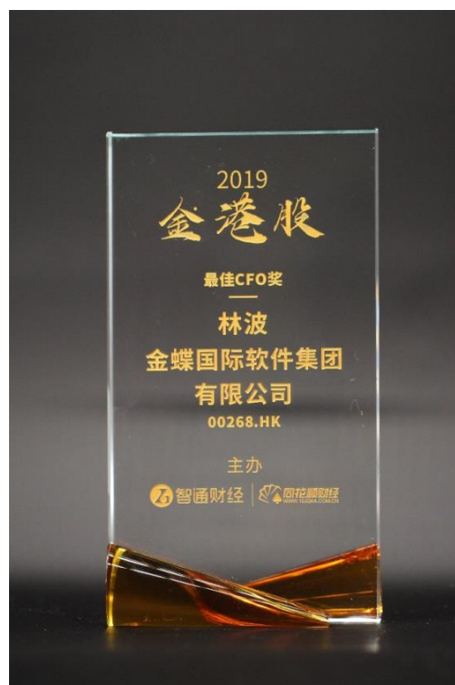
Kingdee Won the “Best Company under Mainland-Hong Kong Stock Connect Program” and the "Best CFO Award”

The “2019 Golden Hong Kong Stocks Awards” was jointly organized by Zhitongcaijing and Tonghaushun. Returning for its fourth year, Golden Hong Kong Stocks Awards attracts attention from more than 6 million investors and has provided the benchmarks for investors to select the most valuable Hong Kong stocks with the greatest growth potential in the year. Companies with combined total market capitalization of over HK$7 trillion participated in the "Golden Hong Kong Stock" competition last year. In addition, over 90% are eligible stocks under the Mainland-Hong Kong Stock Connect Program. The professional judging panel is composed of representatives from the Chinese Securities Association of Hong Kong, a number of economists,